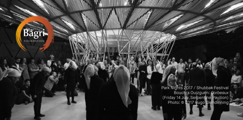
Park Nights 2017 / Shubbak Festival Bouchra Ouizguen: Qorbeaux (Friday 14 July, Serpentine Pavilion)